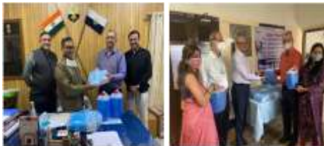
Puja Parikrma 14.11.2021